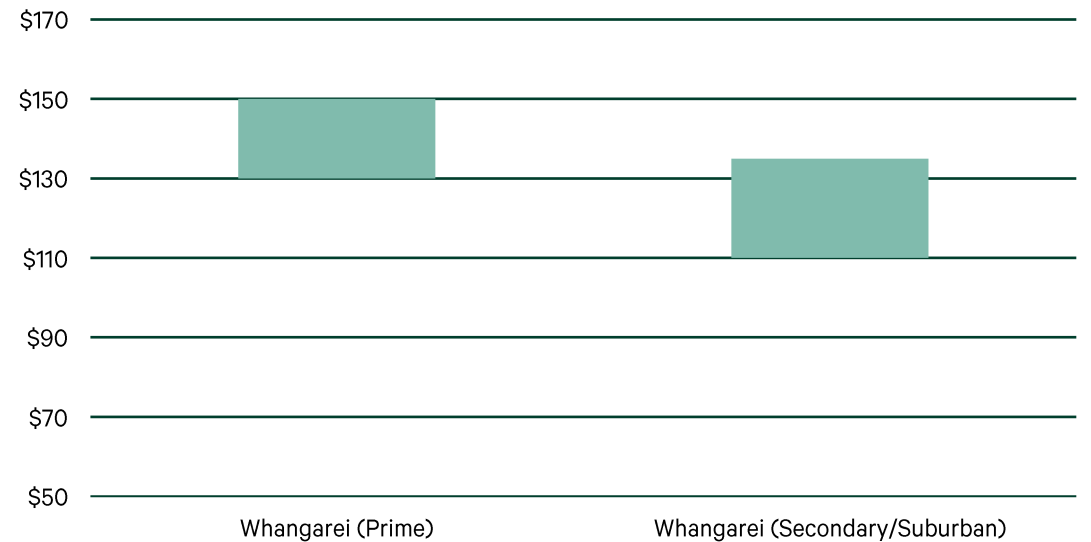
Net Rents (Warehouse/Workshop)